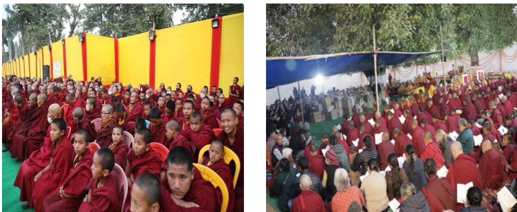
Khari Nuns attending Tenshyuk.