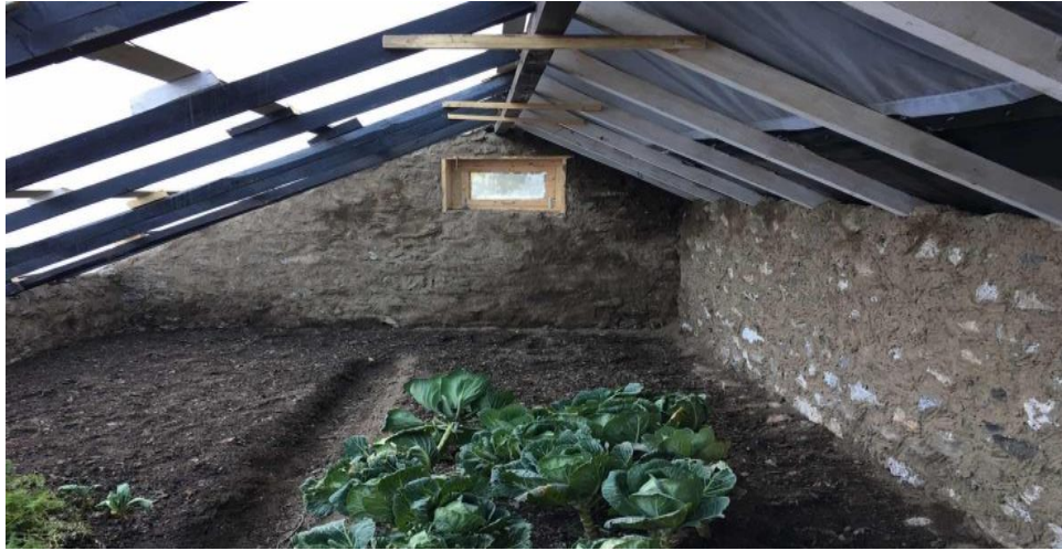
Vegetables inside the greenhouse