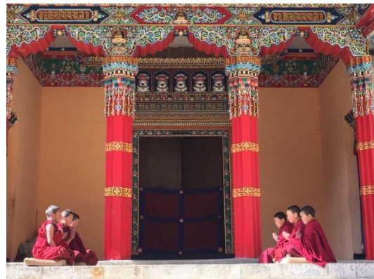
First day, young nuns practicing debating in Buddhist Philosophy in front of Khari Nunnery.