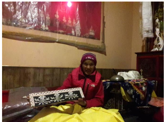
Nuns learning to make Torma.