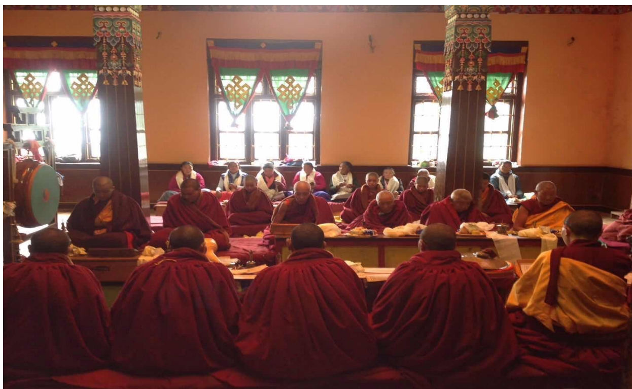
Special Prayer on Chokor Duchen

The meditation centers on the recitations, mantras, and guided visualizations of the Thousand-Armed Chenrezig (Avalokitesvara), the embodiment of all the buddhas' loving-kindness and compassion. Nyungne; translated as "abiding in the fast," is said to be effective in the healing of illness, the nurturing of compassion, and the purification of negative karma). Our nuns stayed for two sets of fasting on Chokor Duchen festival.