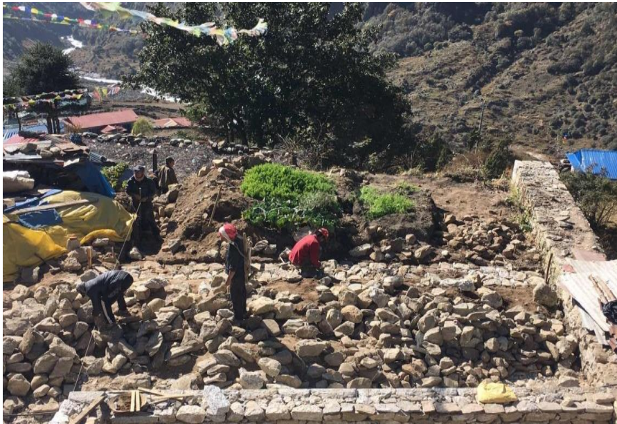
Beginning the construction process of Greenhouse

Green house project is one of the most successful projects of this year. Seeing the rarity of green vegetations in nunnery area due to its altitude, nuns helping themselves with different, difficult methods like preserving the summer vegetables in harsh winter climate and fermenting them affecting nuns general wellbeing Trish Kelly generously fully funded this project with very good , farsighted and kind motivation. Now, our nuns can enjoy all year round green vegetables in their diet which is really helping their health. We all convey our heartfelt sincere thanks and appreciation to you.