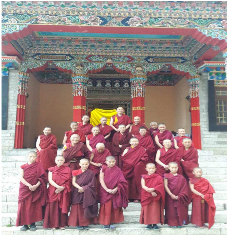
Group photo on Lhabab Duchen

On Lhabab Duchen, the effects of positive or negative actions are multiplied ten million times. It is part of Tibetan Buddhist tradition to engage in virtuous activities and prayer on this day. At Gonpa, our nuns sat for two sets of Nyungne( abiding in the fasting).