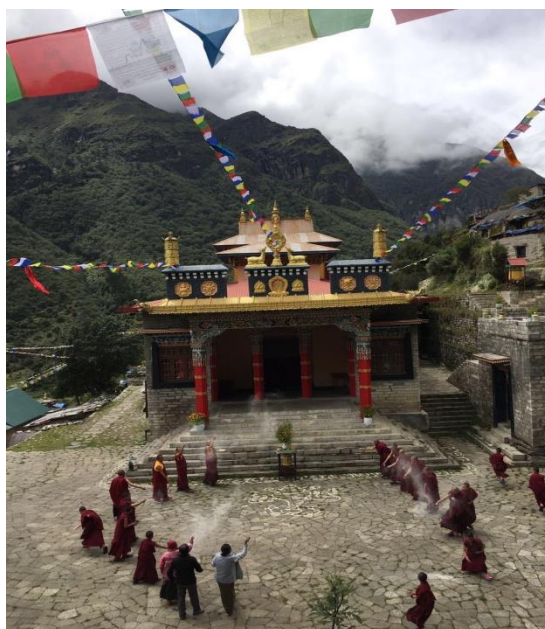
Buddhist prayer flags flutters around Khari Gonpa on His Holiness The 14th Dalai Lama's Birthday.