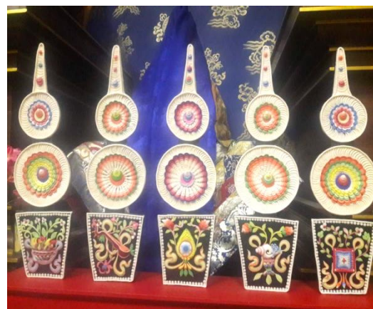
Nuns made Torma.