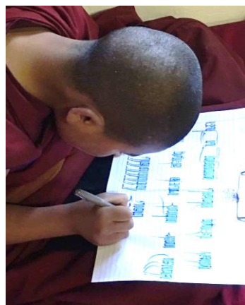
Written exam in prayer hall.