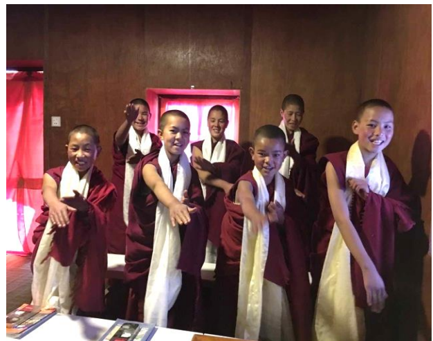
Inauguration of debate to young nuns.