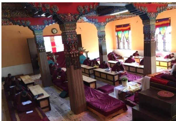
Oral Exam in prayer hall.