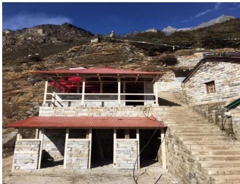
Before constrution and after completion of bathroom and toilet for nuns.