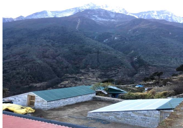
Khari Gonpa's Green House project of 2018