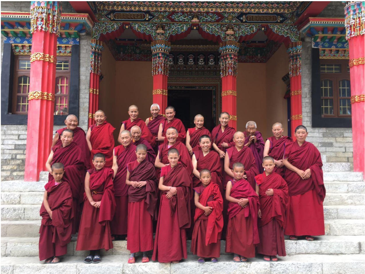
Khari Nuns group Photo

In this way we had a great, meaningful and a successful year but without having love, kindness, and generous supports from each one of you, it would be really impossible. We are always thankful to all the generous supports we have received from each one of you and your organization. We; the family of Khari nunnery wishes each one of you and organizations a very happy and prosperous Tibetan New Year and may this year be fill with lots of inner happiness, success, and the best of wellbeing . We once again express our heartfelt sincere thank you and appreciation for all the kind supports you all have showered on us for many years and appreciate your continued supports.