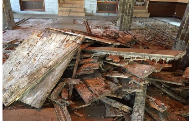
Rotted wood of prayer hall floor