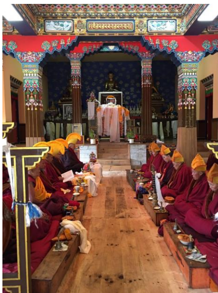
Special prayer session on Saka Dawa Festival