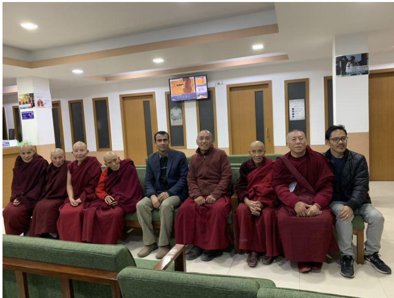
Medical checkup photo with doctor