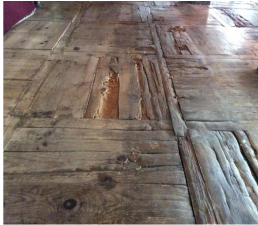
Inside prayer hall floor was badly damaged (rotten wood)