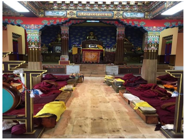
prayer hall floor after completion