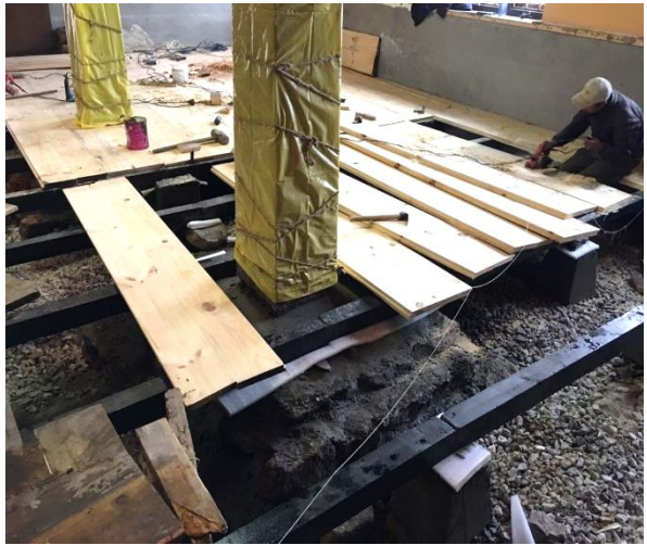
Prayer hall floor in reconstruction processes