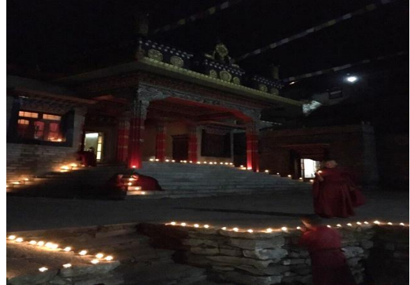
In front of Khari Nunnery, nuns are performing ritual on Gaden Ngamchoe at Night