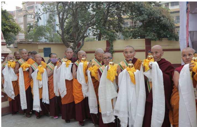
Khari Nuns offering Buddha statue to His Holiness 14th Dalai Lama at Tenshyuk ceremonies.